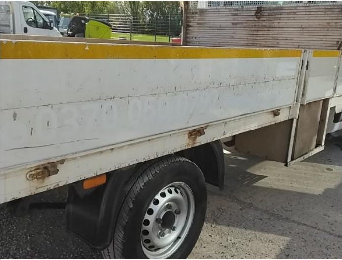
15: Other N/A N/A