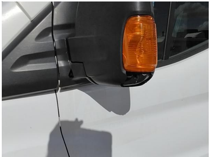
6: Door Mirror Assy nsf Broken Replace