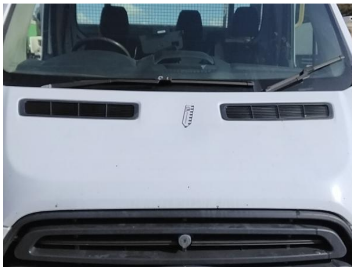
2: Bonnet Chipped Multiple Chips