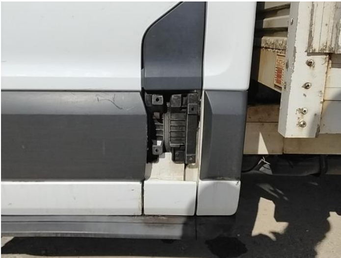
11: Door Moulding nsf Missing Replace