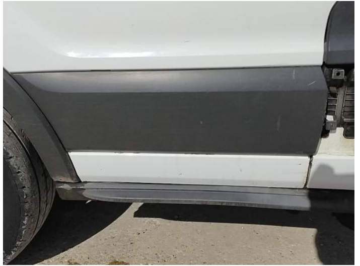
10: Door Moulding nsf Scuffed (Unpainted) UpTo 100mm