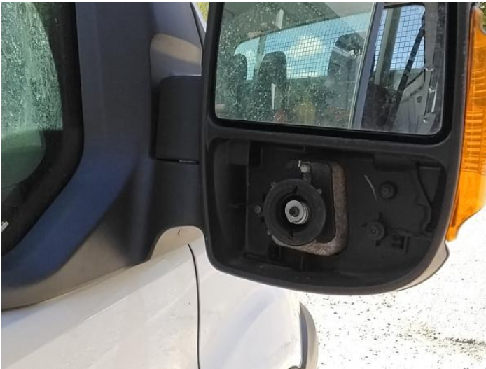
17: Door Mirror Glass os Missing Replace