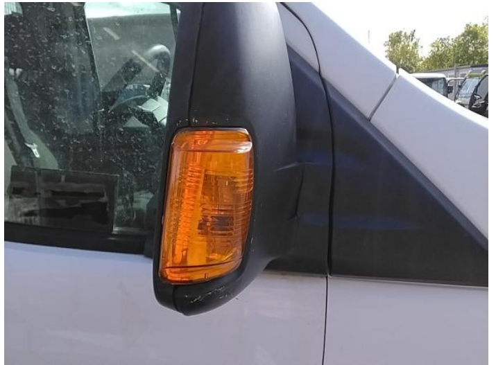
18: Door Mirror Assy osf Scuffed (Unpainted) UpTo 100mm