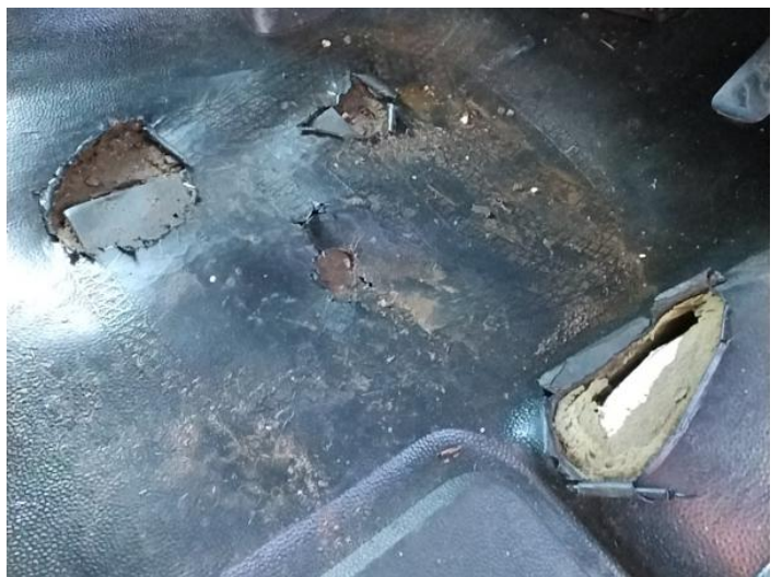
20: Carpets Front Holed Over 3mm