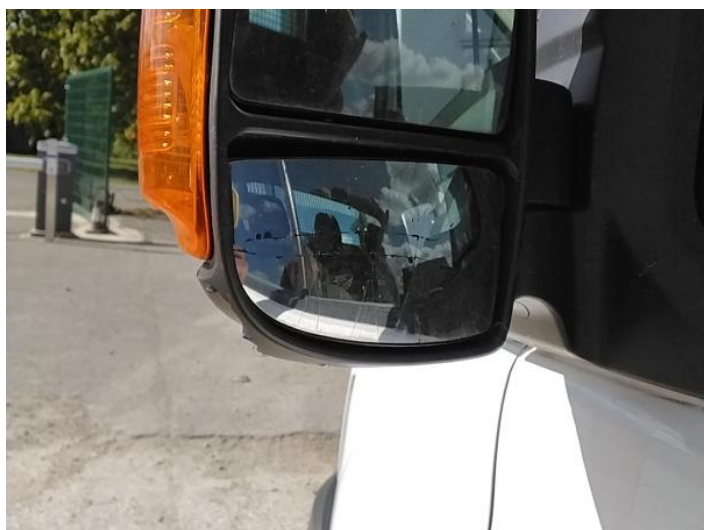
8: Door Mirror Glass ns Broken Replace