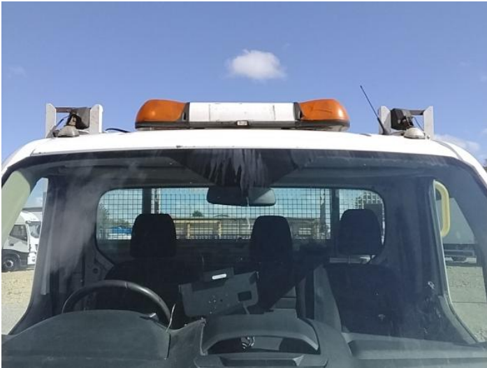
3: Other N/A N/A