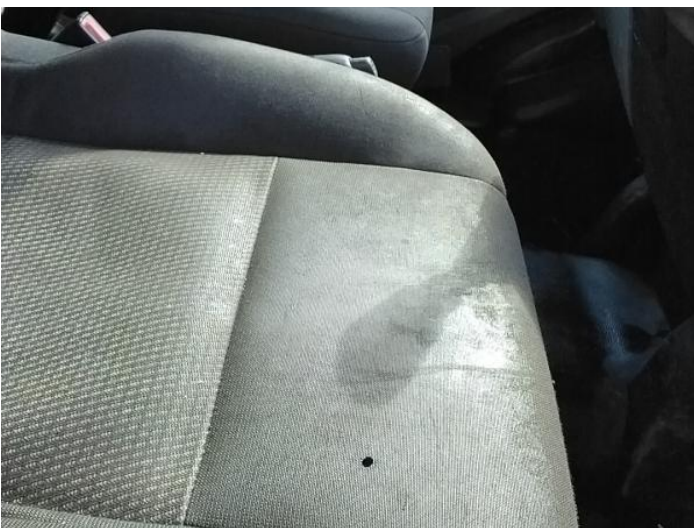
19: Seat Base Cover osf Burn Over 3mm