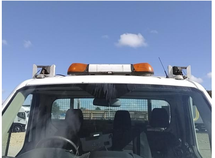
4: Other N/A N/A