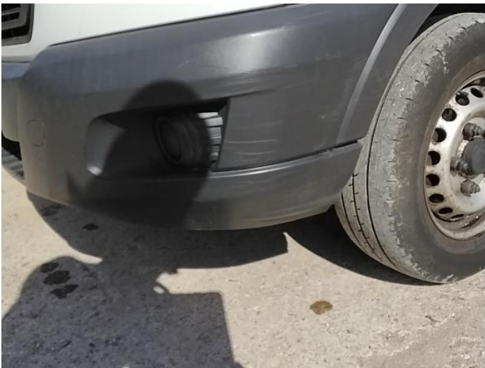
5: Bumper Front Moulding Scuffed (Unpainted) UpTo 100mm