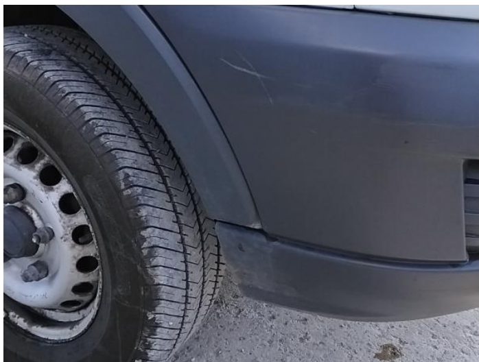
1: Bumper Front Moulding Scuffed (Unpainted) UpTo 100mm