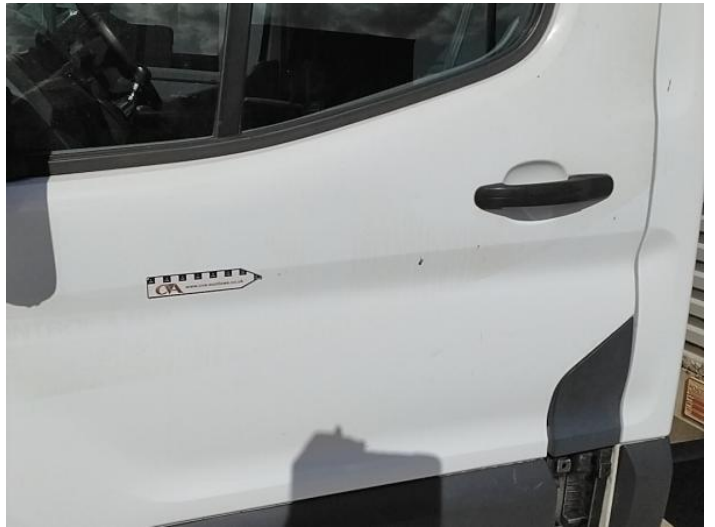
12: Door nsf Scratched UpTo 25mm Thru Paint