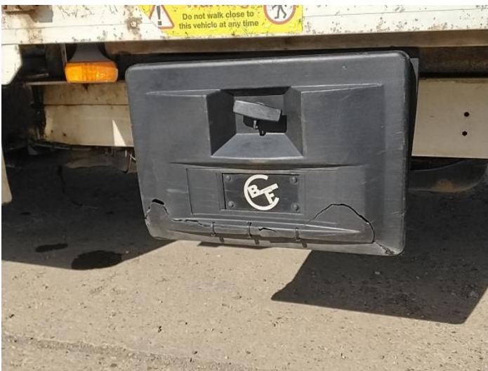
13: Other N/A N/A