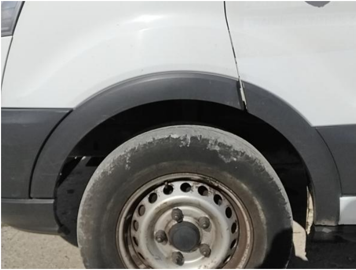
9: Moulding nsf Wing Scuffed (Unpainted) Over 100mm