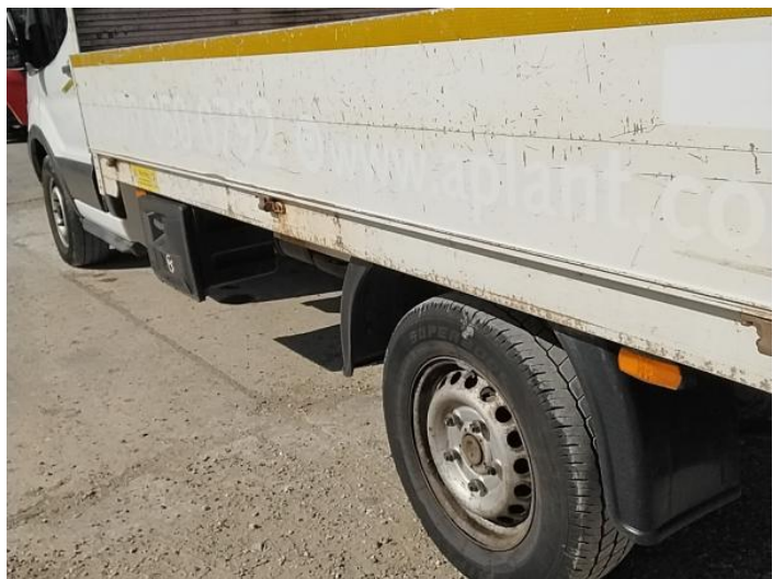
14: Other N/A N/A