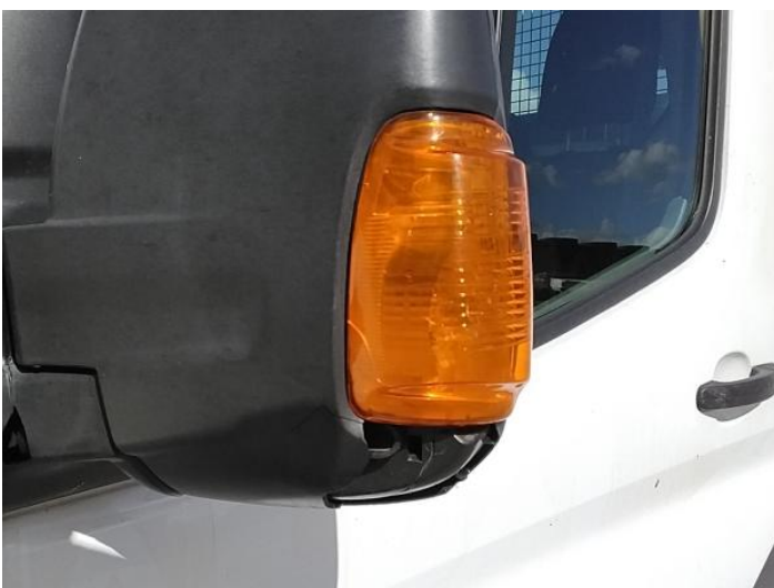
7: Flasher Side Repeater ns Broken Replace