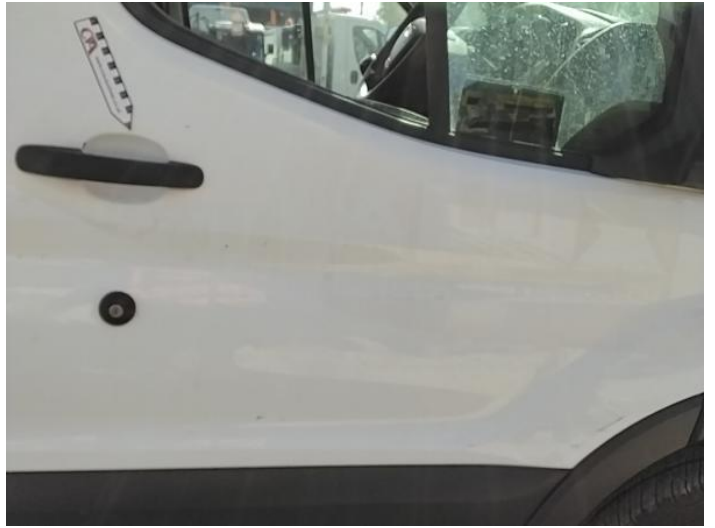
16: Door osf Scratched UpTo 25mm Thru Paint